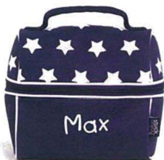
PERSONALISED LUNCH PAILS