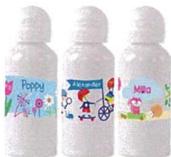
PERSONALISED DRINK BOTTLES